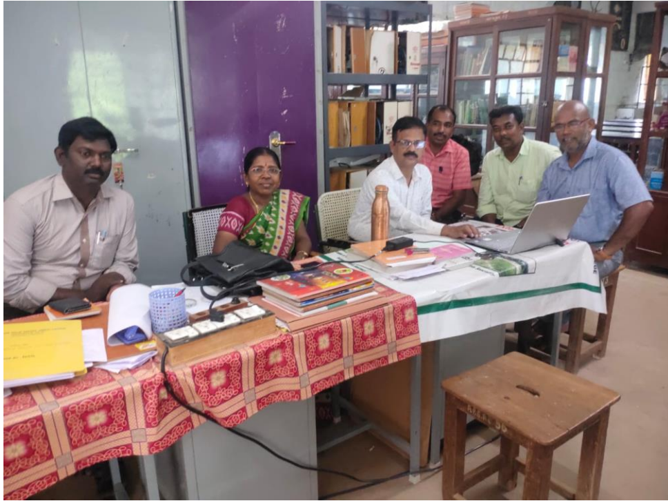
GURUDAKSHARAMB Committee Planning Meeting held on 9.05.2022