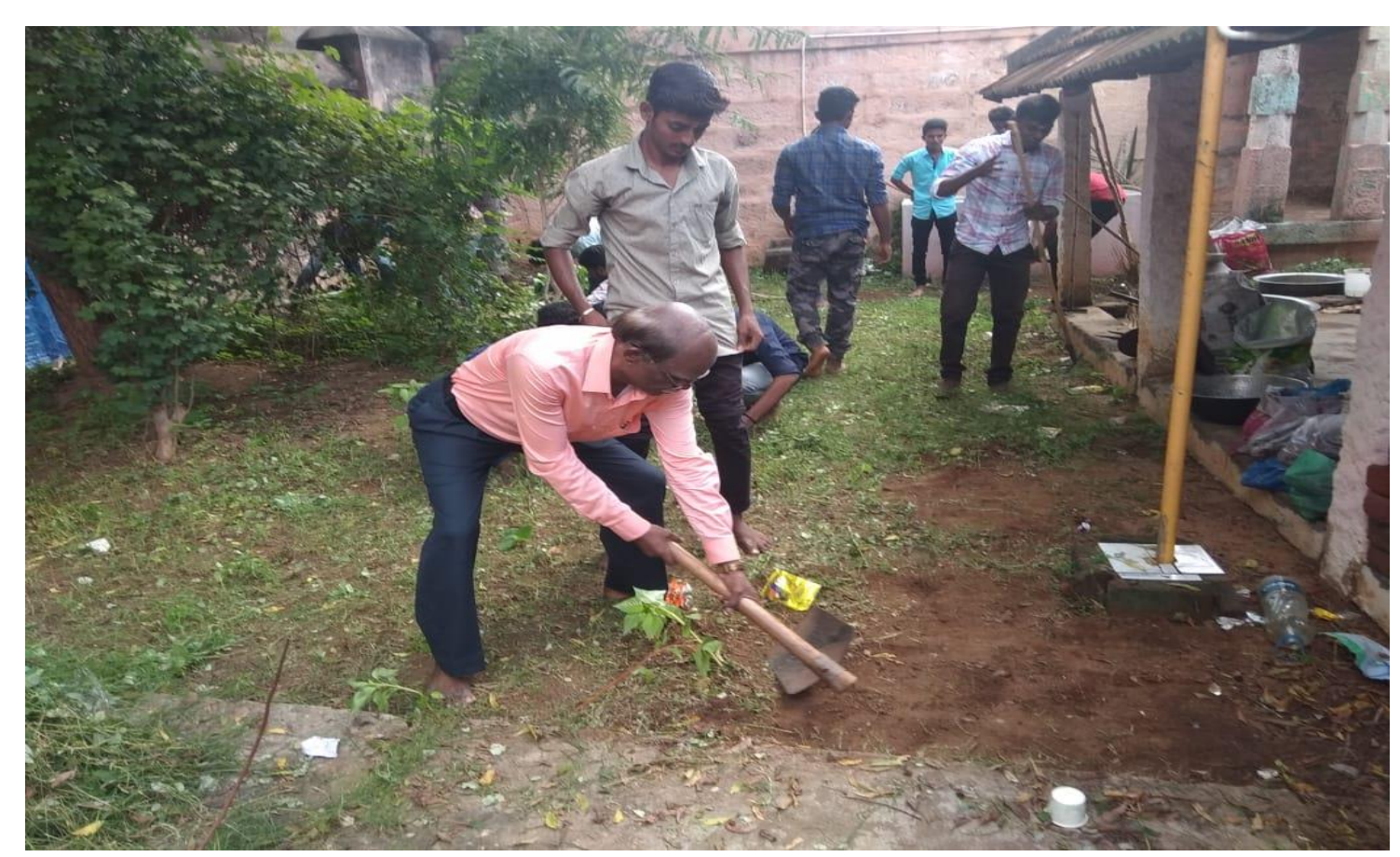
Removal of Glass Bottles and shrubs inside the temple

All the second year B.Com students came into Aadhi Thiruthalinadhar temple, Tiruppattur. They were grouped among themselves worked for Removal of Plastics, Removal of Glass Bottles and shrubs inside the temple and locating dustbins.