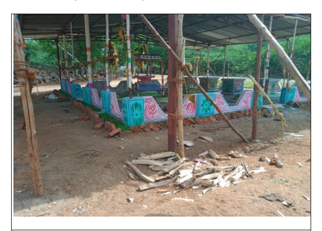
Appearance of Siva Temple area before cleaning by the students

The pamphlets provided insights into the significance of soil testing for agricultural productivity. By understanding the nutrient composition of their soil through testing, farmers could optimize fertilizer usage, ensuring balanced and efficient crop growth while minimizing environmental impact. Through these combined efforts, the program sought to empower the communities of Korati and Thulavoor with knowledge and practical solutions to address environmental, health, and agricultural challenges, fostering sustainable development and well-being.