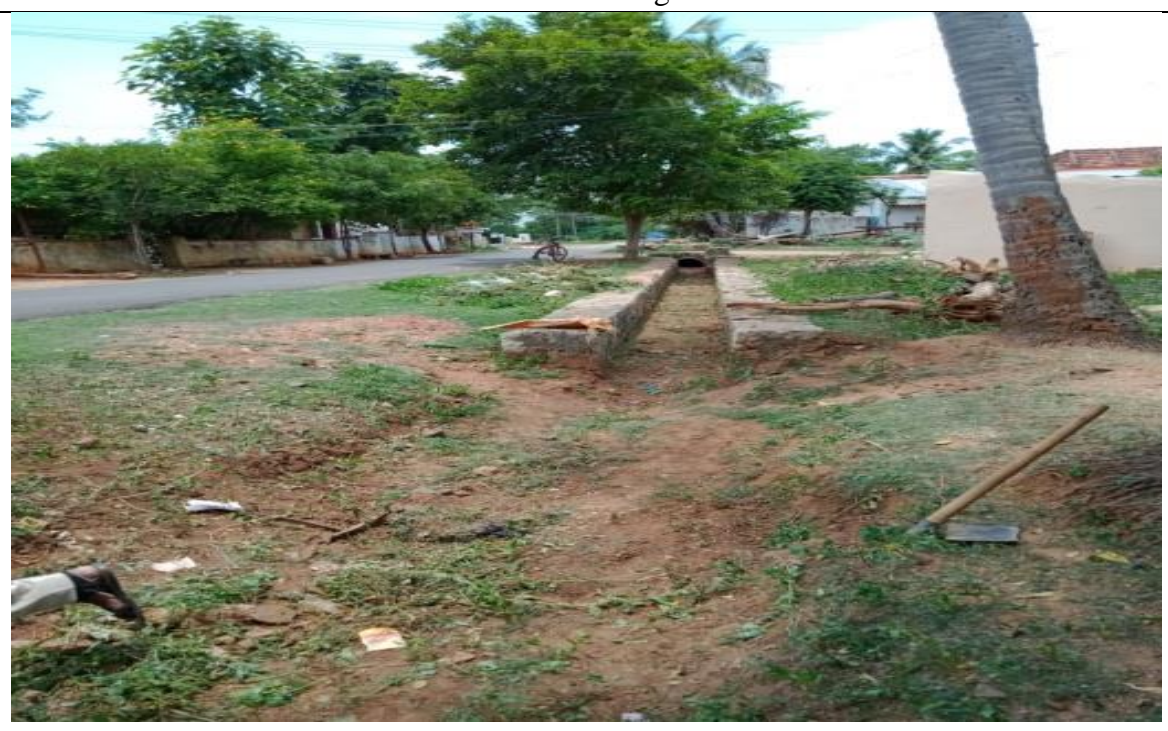
After leaning the Canal