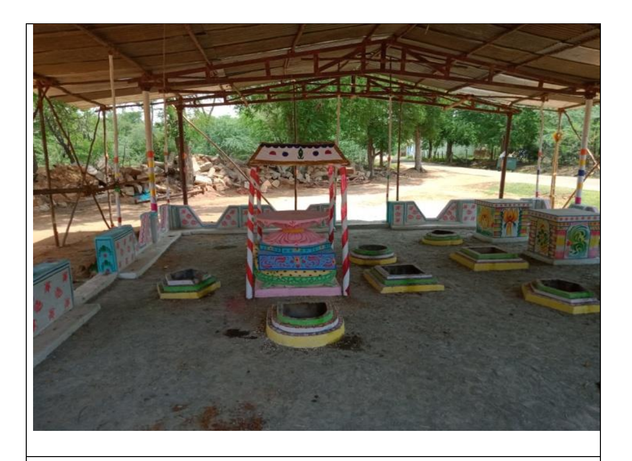
Appearance of Siva Temple area after cleaning by the students

On the second day one part of students cleaned the source canal of the pond and society hall in Thulavoor and the another part of the students demonstrated the prevention of dengue fever by cleaning the source of mosquito breeding site in the houses and explained them by visiting every house.