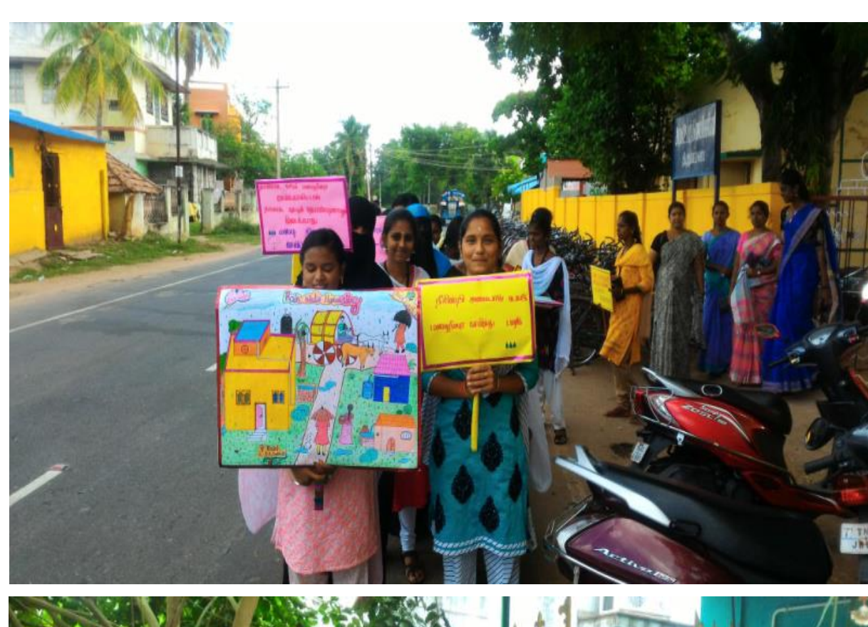
Students giving awareness related to common environmental issues and health problems.