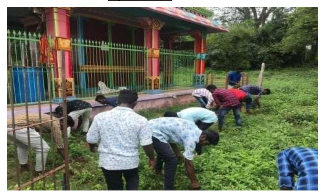
Fig – 1 - Students cleaning the Temple premises in Nedumaram village.

II BBA Students of 2019-2020 Batch are engaged in Two days service programme held in Nedumarn village near Tirupattur on 21st and 22md September 2019