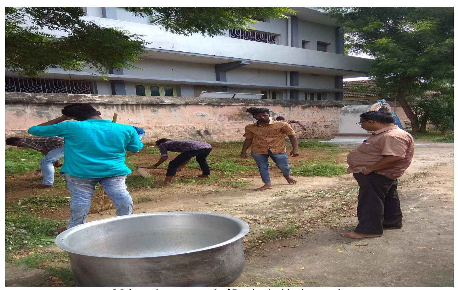
Male students removal of Bottles inside the temple