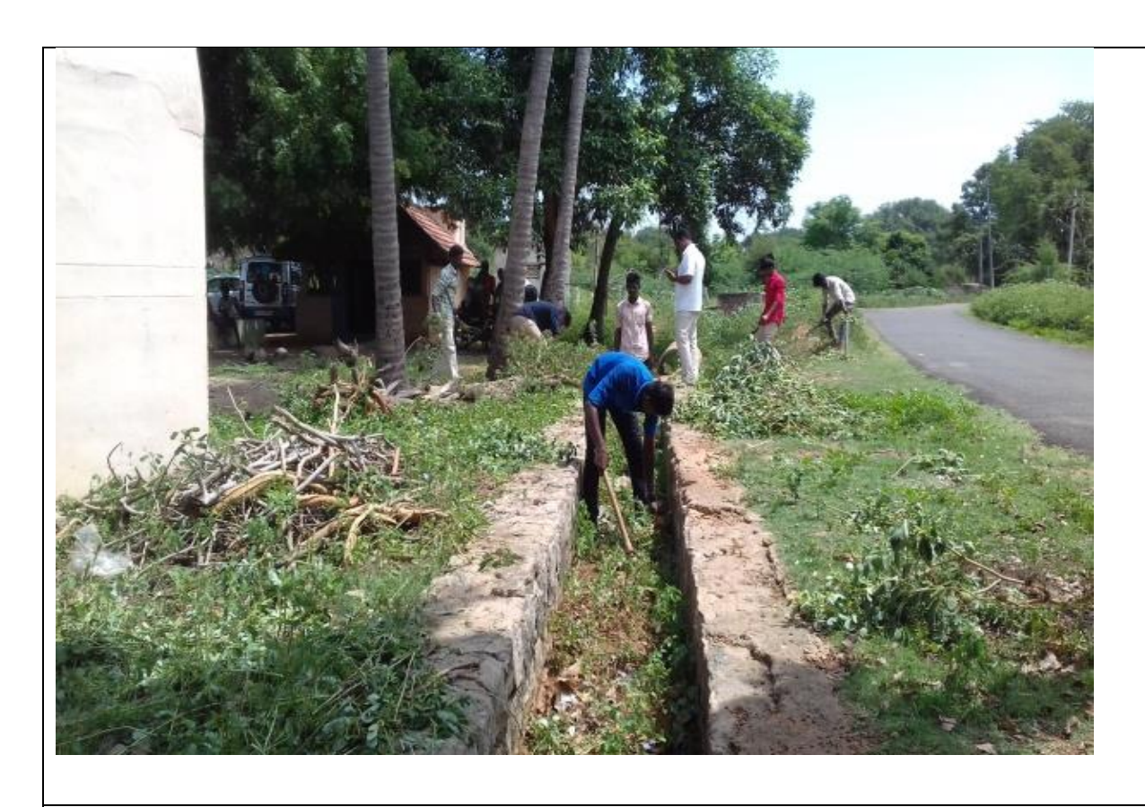
Students cleaning the Canal