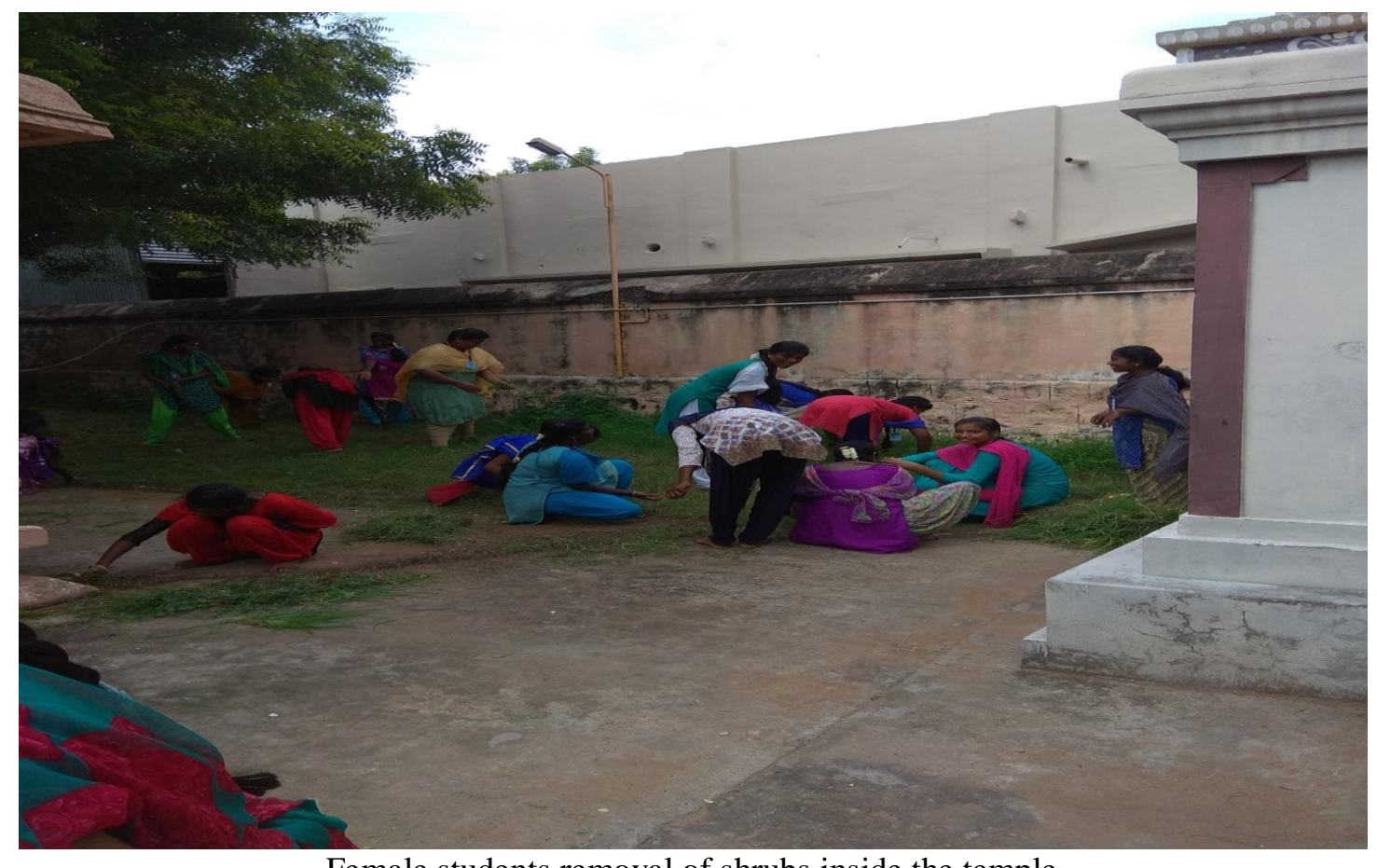
Female students removal of shrubs inside the temple