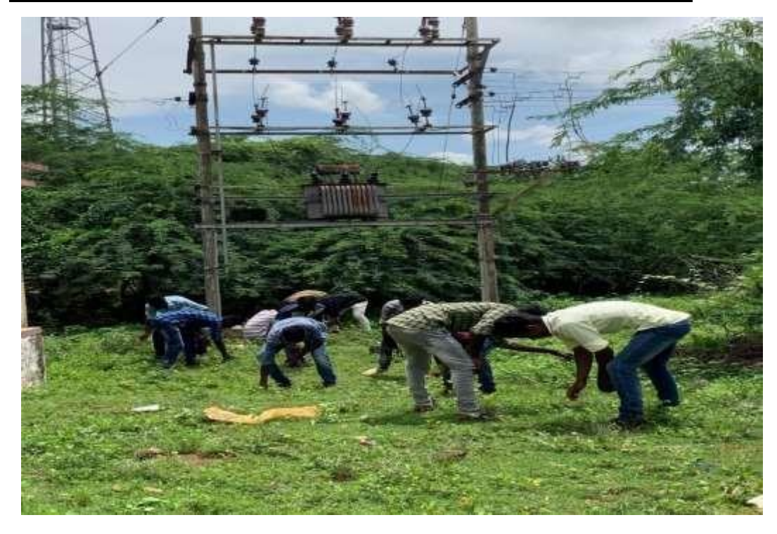
Fig – 2 – Students Cleaning the Government School Campus