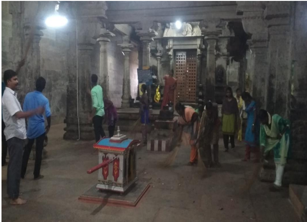
Cleaning of Temple premises