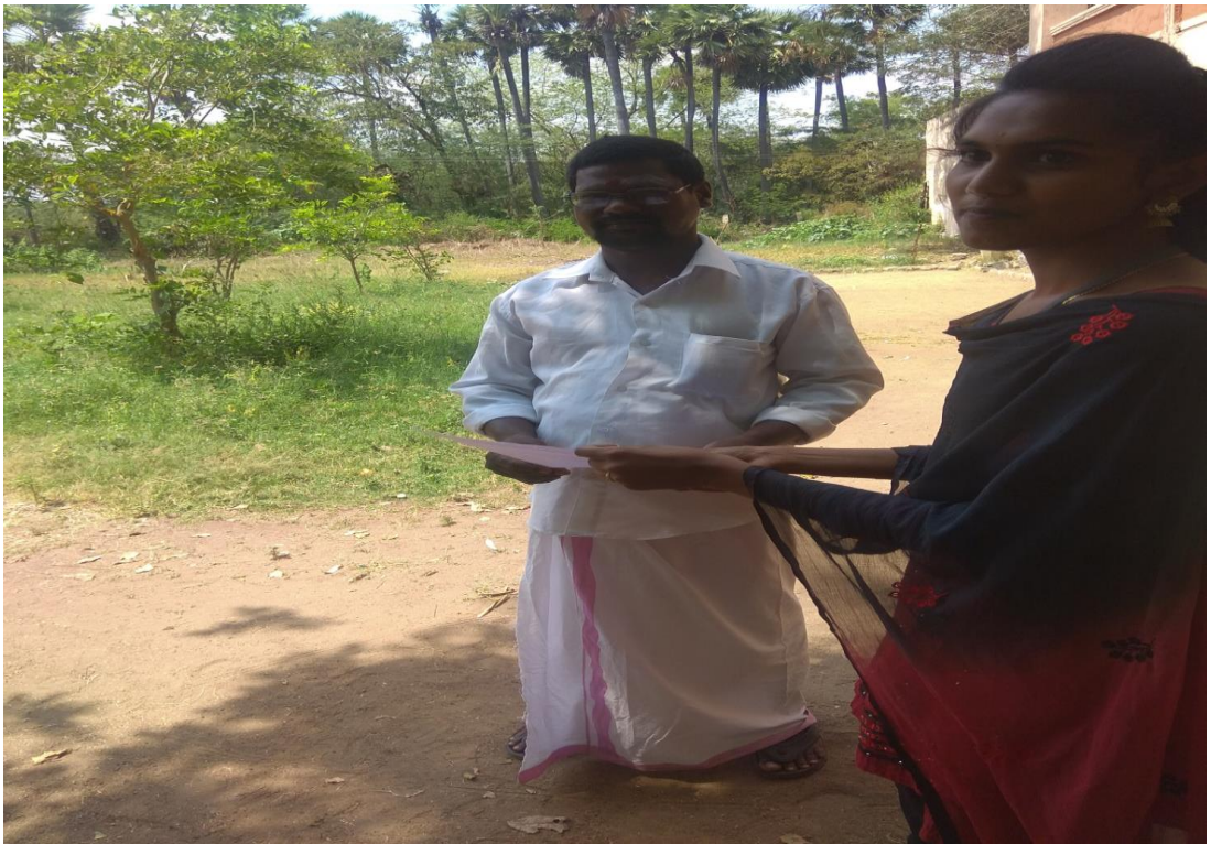
Rain water harvesting Pamphlets Issued to Local People