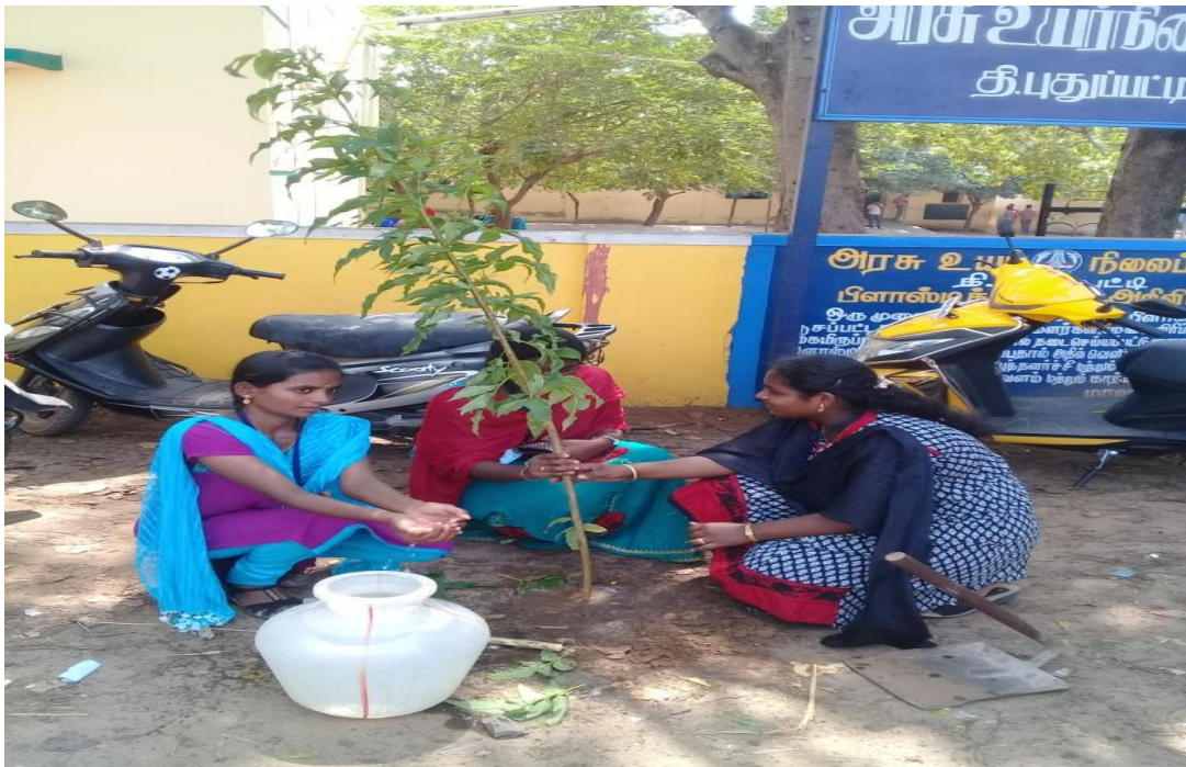
Students stressing the importance of keeping their environment clean by closing the water drums.