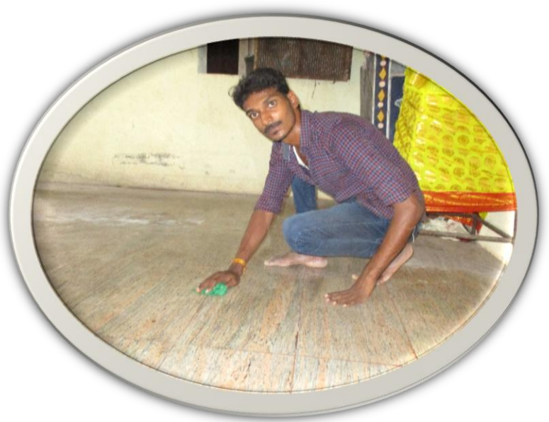
Tree plantation & Temple Cleaning @ Eriyur Malai Maruntheeshwarar Temple