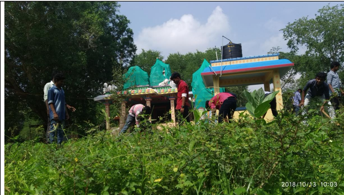
Before cleaning of front portion of the Lord Shiva Temple in Koratti village