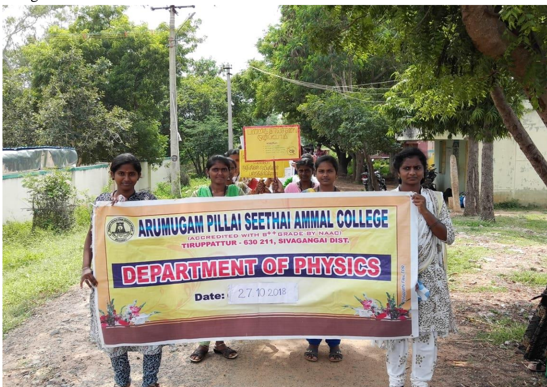
II Physics students gave the Dengue awareness rally at Kottaiyeruppu village on 27.10.2018 .