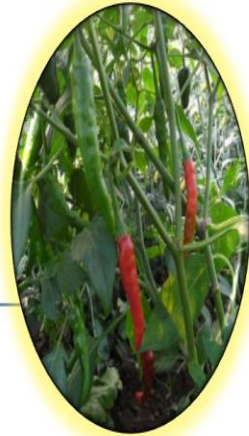
Seeds Packet Purchased from Agricultural Department and Distributed to the Students