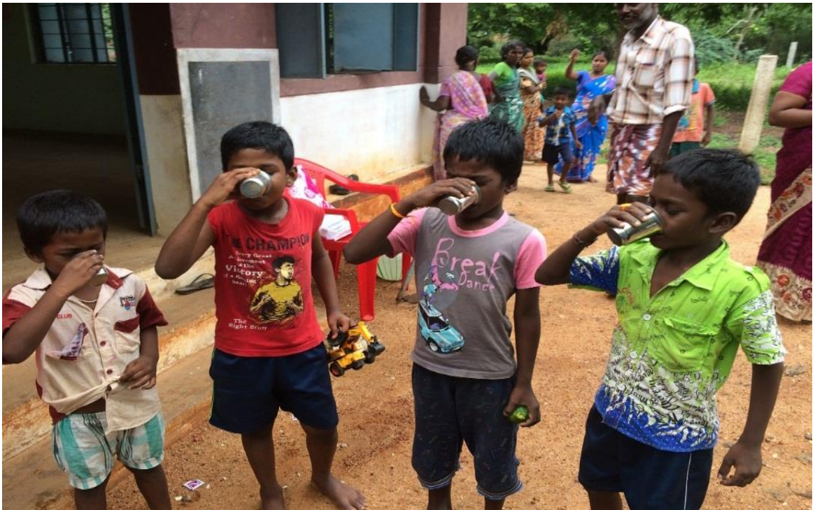
Nilavembu Kudineer is distributed to the villagers