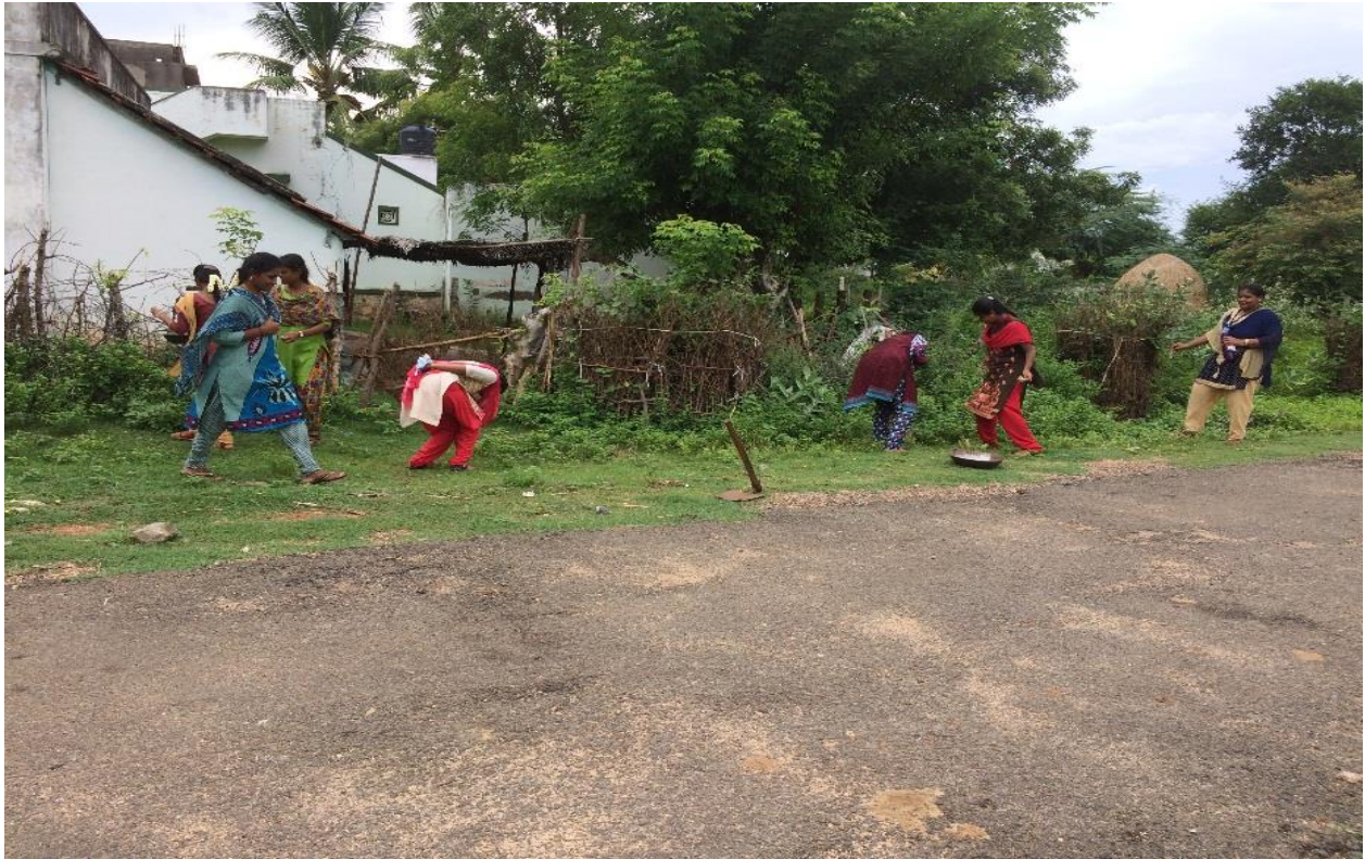
Students cleaning the school premise on 06.10.2018.