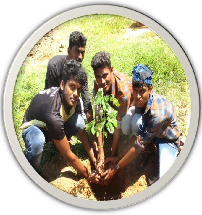
Tree Plantation @our College Ground