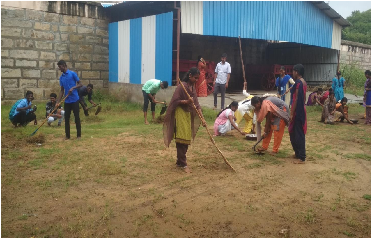
Cleaning of Temple Complex in Progress