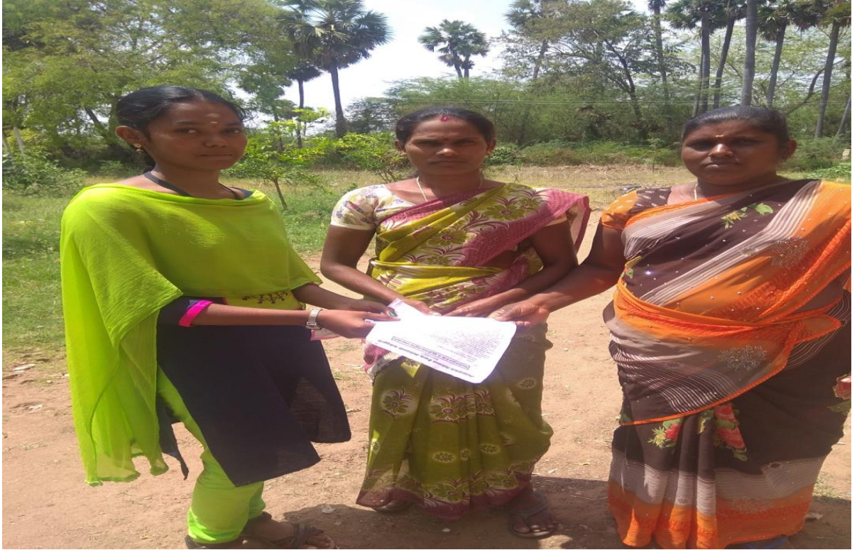
Pamphlets of Importance of Cleanliness Issued to Local People