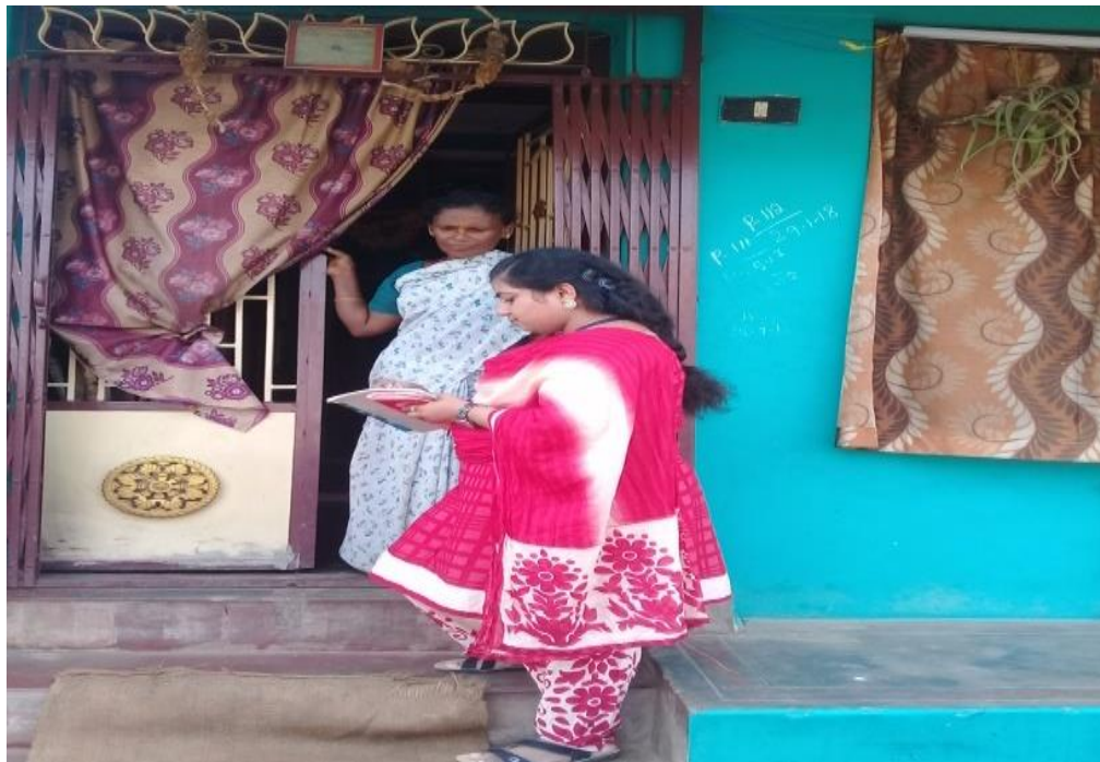
Students in door to door campaign stressing the importance of rain harvest