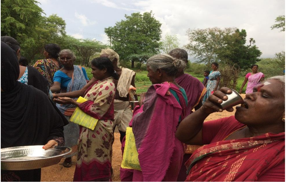
Students cleaning the surroundings of the temple