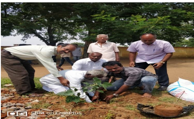
Planting Trees in school campus

Besides the students of II BBA were assessed on the basis of their effective participation and devoted involvement and contribution in the cleaning camp