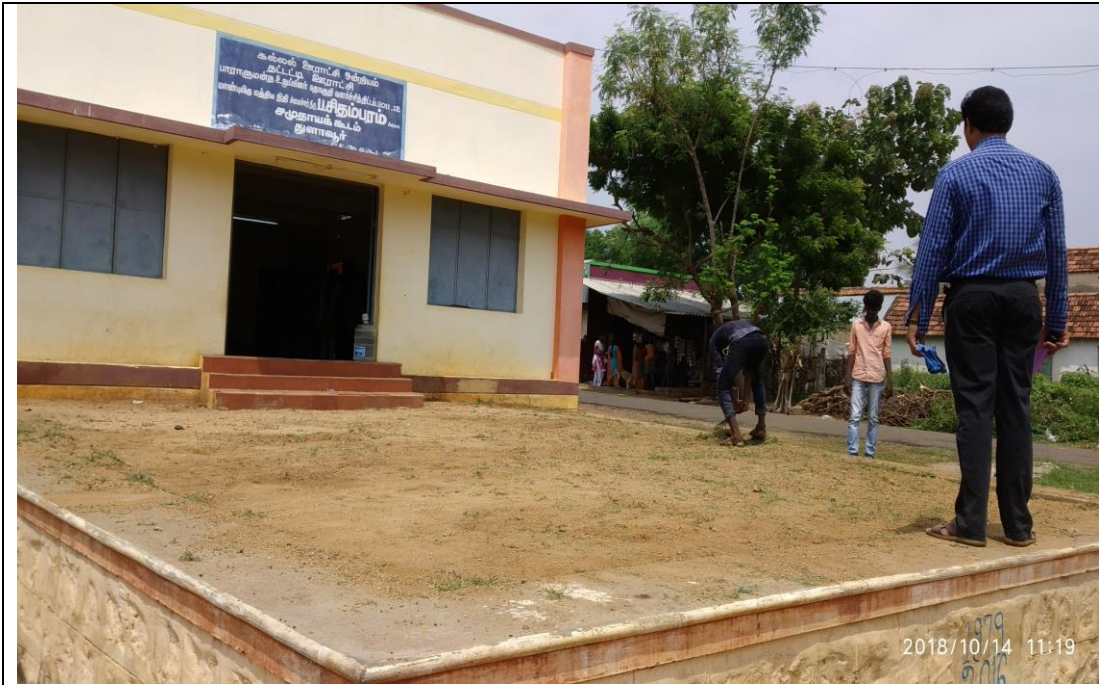
Cleaning the community hall in Thulavoor village