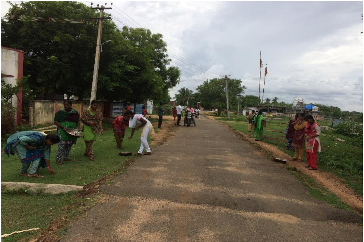
Students cleaning the roadside on 06.10.2018