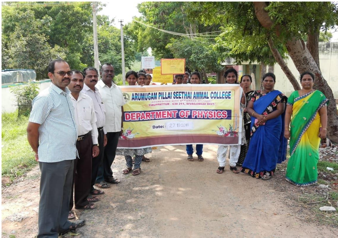
II Physics students with staff members gave the Dengue awareness rally at Kottaiyeruppu village on 27.10.2018 .