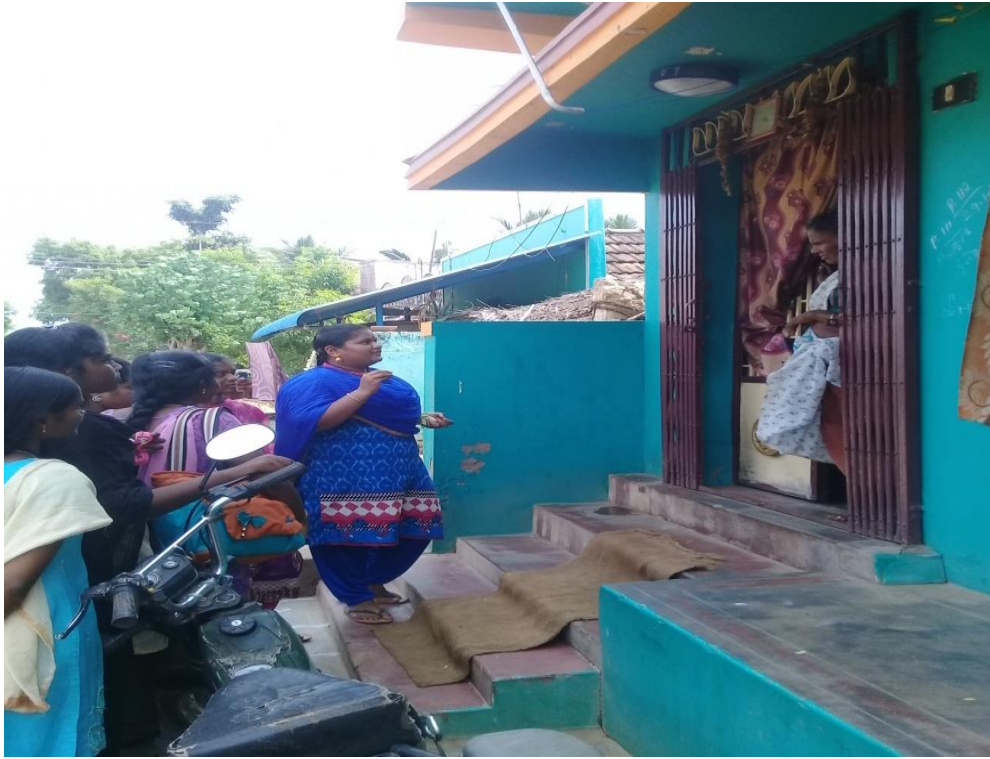
Students giving awareness to the village people about the importance of rain harvest