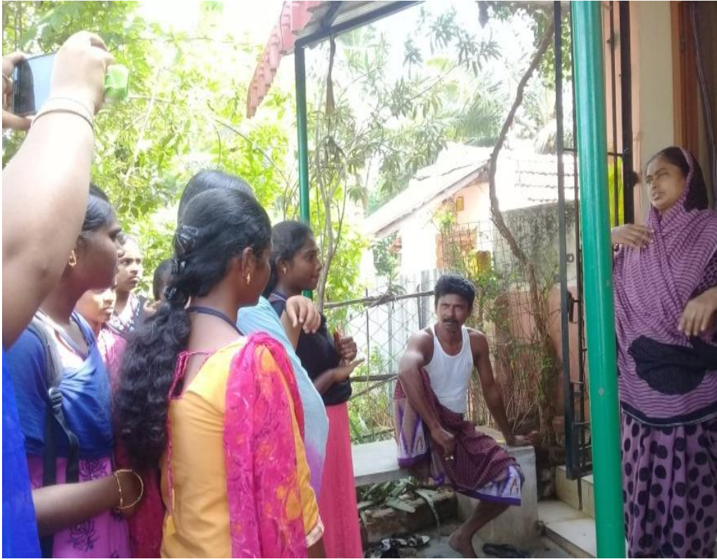
Students planting tree sapling as a stressing the importance of rainharvest