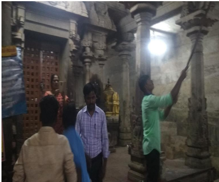
Students cleaning the temple premises