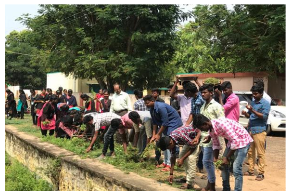
Cleaning of Pond in Pudupatti village.