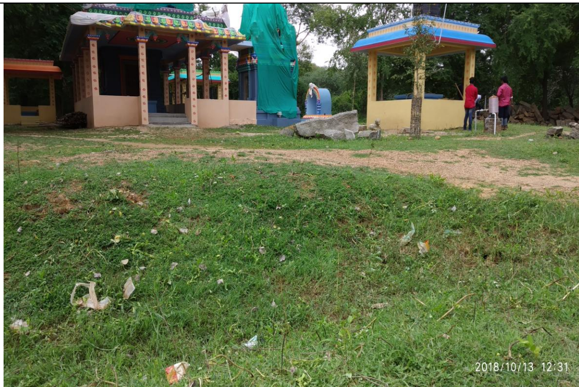
After cleaning of front portion of the Lord Shiva Temple in Koratti village